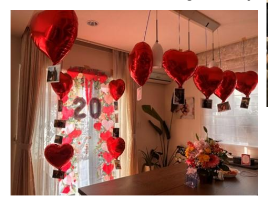
Celebrating Our 20th Anniversary!