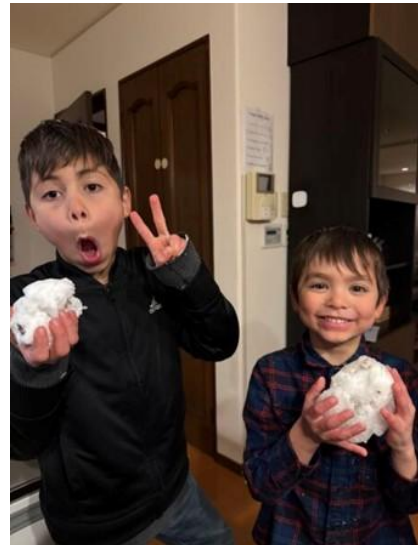
Having Fun with Our First Snow of the Year!