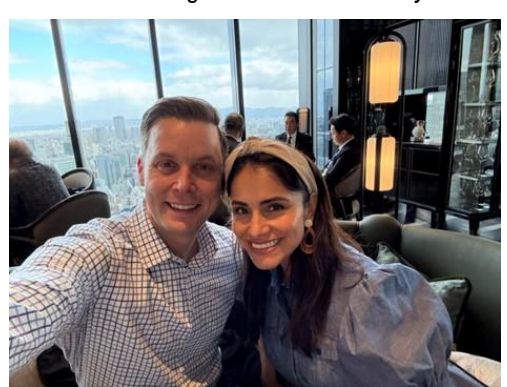
Celebrating Our 20th Anniversary!