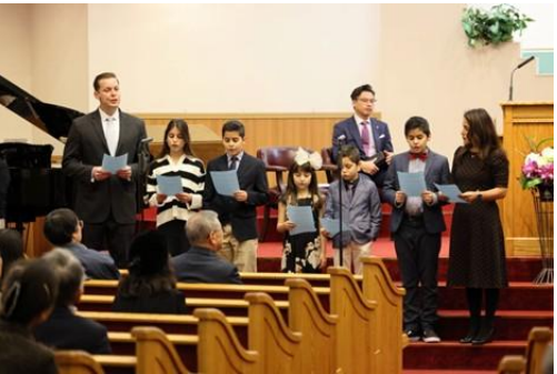
Our Family Singing a Special in Church