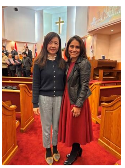
Mami Got Saved!