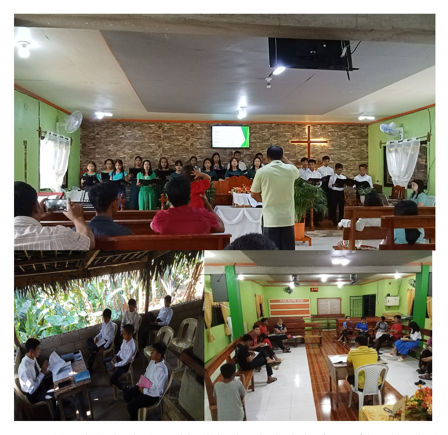
Pastor Rodel Trinidad leading the choir and discipleship class. The thatched roof is one of the Sunday school classrooms at Pastor Rodel's church in the village of Kinalagti, Polillo Island.