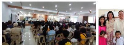
(Remodeled Auditorium & Pastor Family)