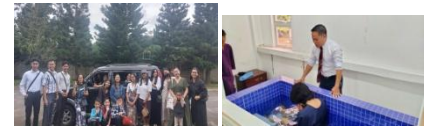
(Soulwinners & picture of two Baptisms)

Thanks for your many gifts for this Church!