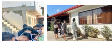
(Sun Sch Bldg & outside of Auditorium)

Because of roof damage from the volcano eruption we were forced to find a new Bldg to start all over. But this was God moving us to a much larger Building and property!