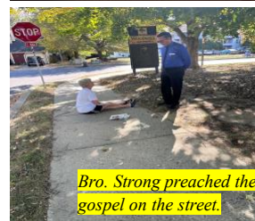
Bro. Strong preached the gospel on the street.