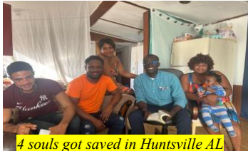
4 souls got saved in Huntsville AL